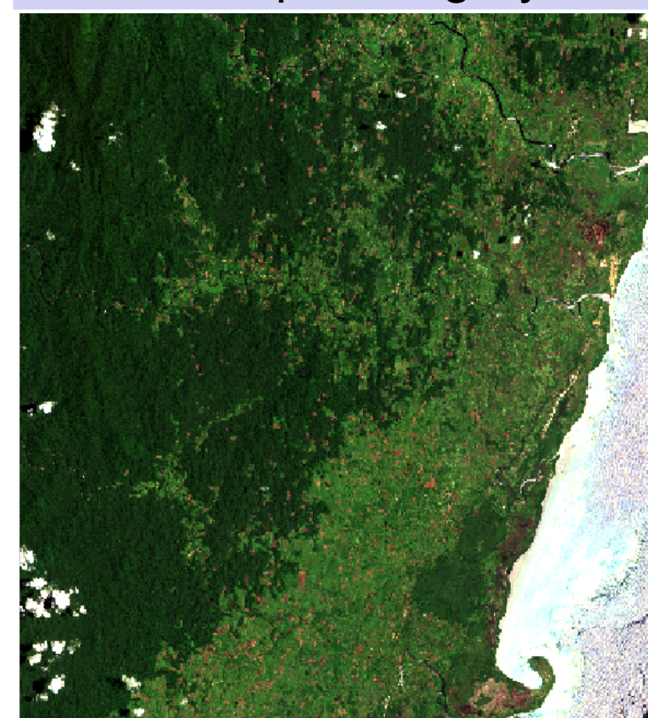
Sentinel 2 image